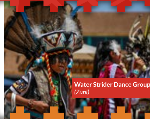
Water Strider Dance Group (Zuni)